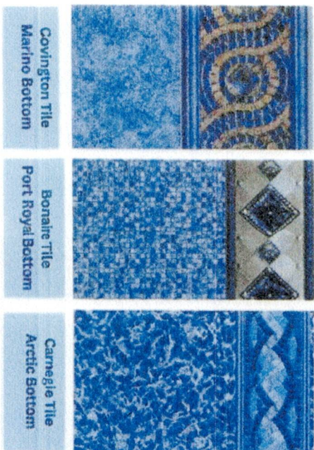
Covington Tile Marino Bottom